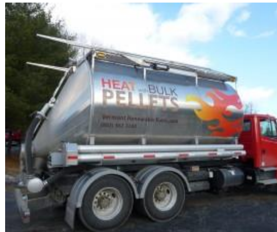
[Vermont bulk pellet delivery truck]

$1.25/sq. ft. of heated space up to $80,000 and an additional incentive of up to $15,000 for thermal storage tanks.