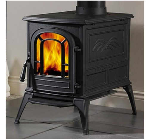
[VT Castings Pellet Stove]