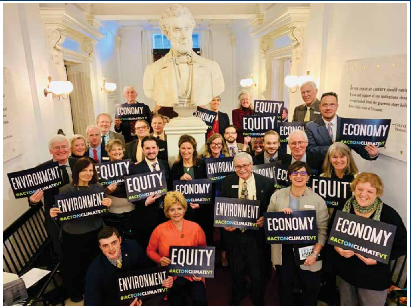
Some members of the legislative Climate Solutions Caucus.

The organizations signed onto these climate action priorities look forward to working with policy makers and all Vermonters to tackle climate change in a way that grows jobs, protects the most vulnerable, enhances public health and safeguards our natural resources.